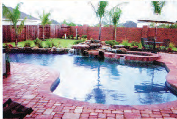
Hard to believe, but this magical getaway, complete with a serene natural stone waterfall and handsome cobblestone decking, is nestled in the heart of a bustling city.