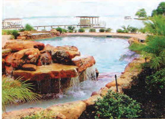
After a long day of boating on the lake, paradise awaits. Gracefully set into a hillside, this pool features a 12-ton natural stone waterfall cove and a large raised spa.